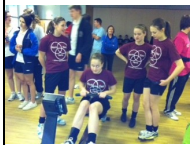
Rowers in Action